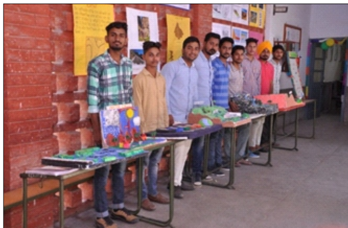
Govt. College, Ropar, Students Demonstrating Models and Charts